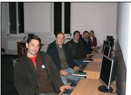
Our Computer Center

When I finished, I was paid one of the highest compliments of my life. The Ukrainian speaker after me said that while I did not speak much, when I did speak people should listen. I felt honored, but knew that it was God who had spoken through me.