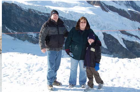
First Termers Conference in the Alps!